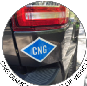
CNG DIAMOND ON REAR OF VEHICLE