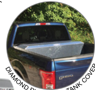
DIAMOND PLATE CNG TANK COVER