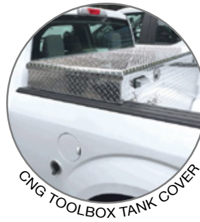
CNG TOOLBOX TANK COVER