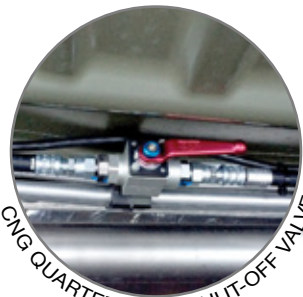
CNG QUARTER TURN SHUT-OFF VALVE