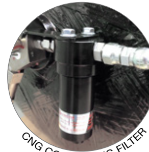
CNG COALESCING FILTER