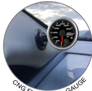
CNG FUEL LEVEL GAUGE