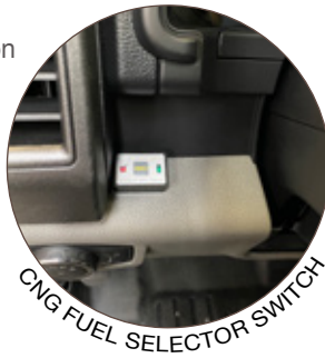
CNG FUEL SELECTOR SWITCH