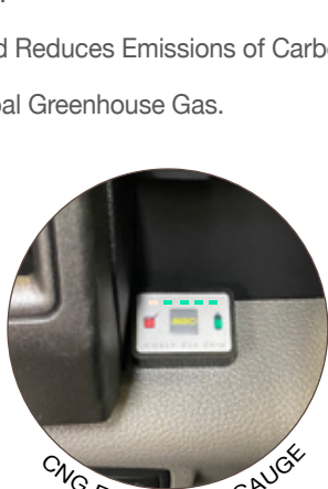
CNG FUEL LEVEL GAUGE