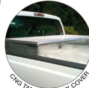
CNG TANK TOOLBOX COVER