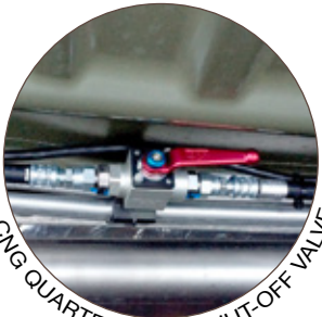
CNG QUARTER TURN SHUT-OFF VALVE