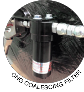
CNG COALESCING FILTER