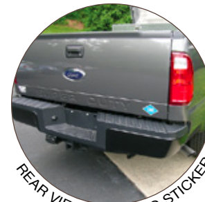
REAR VIEW WITH CNG STICKER