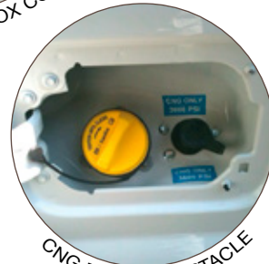
CNG FUEL RECEPTACLE